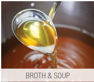
BROTH & SOUP