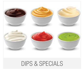
DIPS & SPECIALS