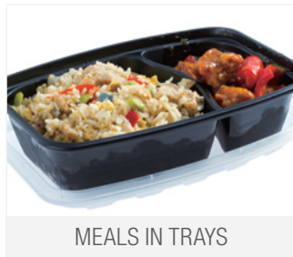
MEALS IN TRAYS